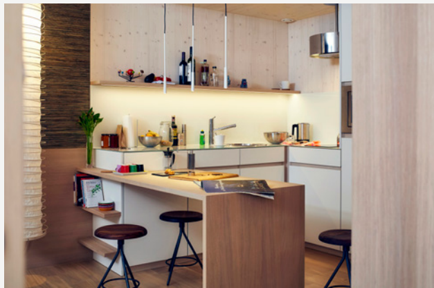
Not a typical hotel room: our apartments with kitchenette.